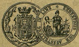
Grosse silberne Medaille 1903.