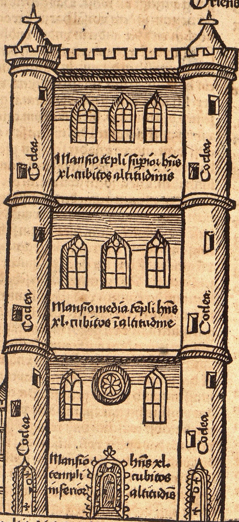
Figura posterioris pars edificij templi secundum fundamentales Ezechiel xli.