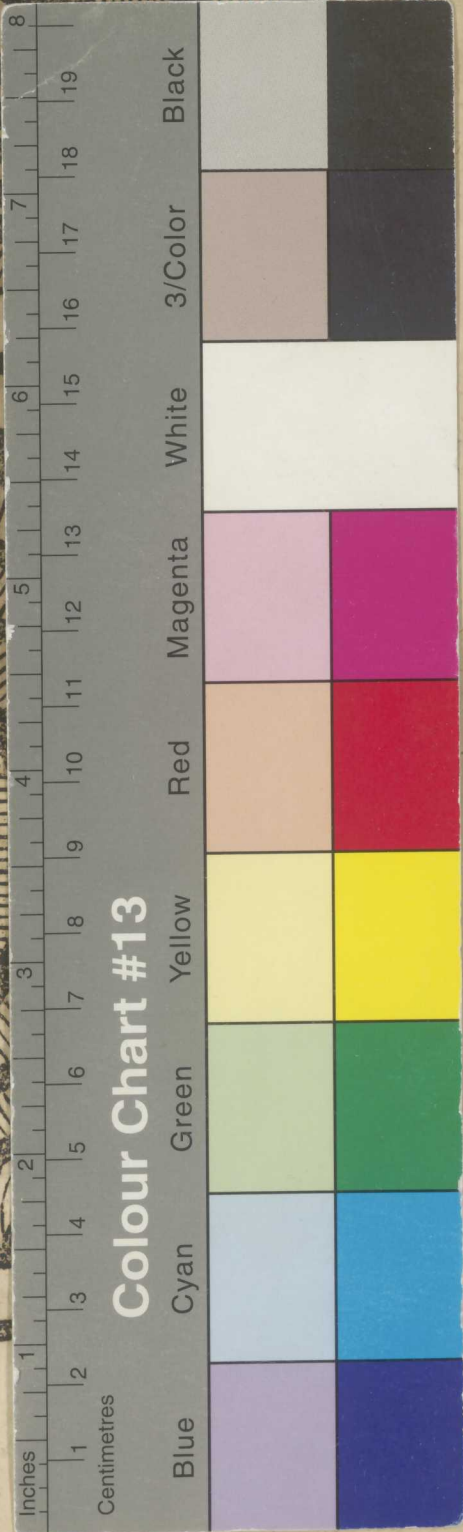
Colour Chart #13