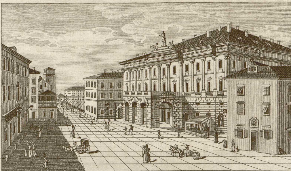
Die Börse in Triest.