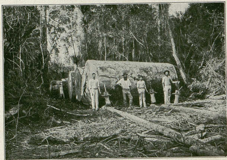
Ein gefällter Urwaldriese.