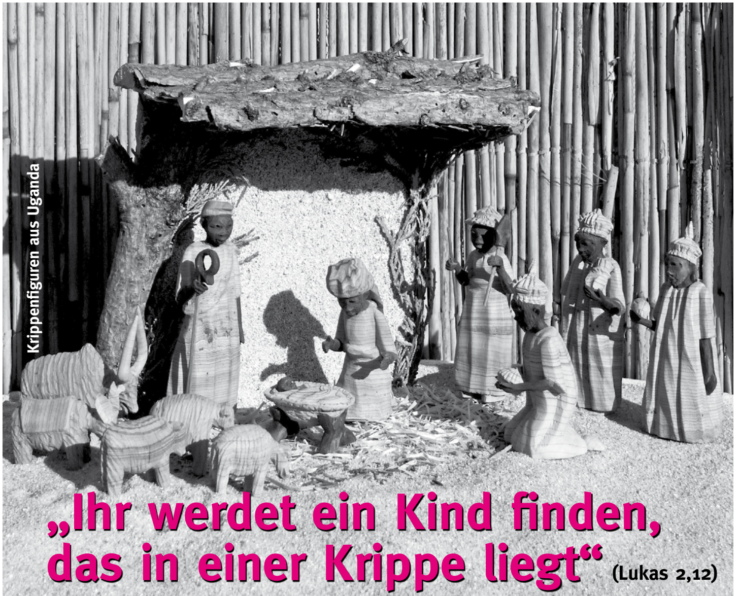
Krippenfiguren aus Uganda

MITTEILUNGEN AUS DER RÖM.-KATH. PFARRE ST. STEPHAN WELS-LICHTENEGG