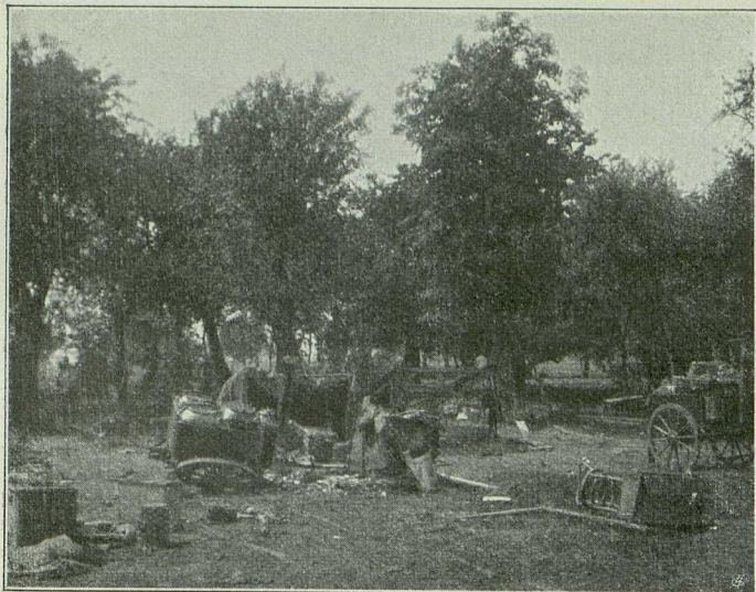
Zerschossene Küche der 3. Kompanie bei Przemysl.