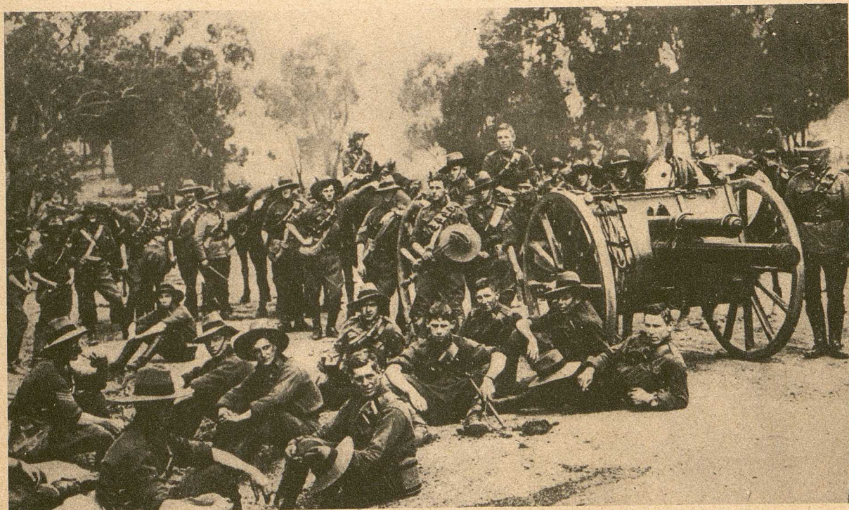
Men of the Australian Lighthorse who fought so gallantly on the Gallipoli peninsula. Leute der australischen leichten Reiterei. Selbst die „Anzacs“ (Australian New Zealand Army Corps) haben dem Ansturm der vom Gegner verachteten türkischen Truppen nicht widerstehen können.