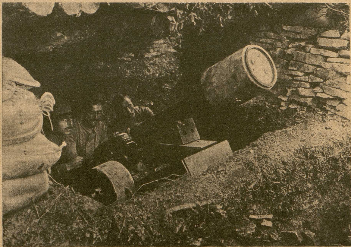
THE MOST FORMIDABLE OF THE FRENCH ARMY'S TRENCH-ARTILLERY: AN 80-MM. MOUNTAIN-GUN WHICH CAN HURL AN AIR-MINE WEIGHING 236 LB. (SHOWN LOADED WITH ONE OF 130 LB.)

Links oben: französisches Lufttorpedo wird abgefeuert. Ein 58-mm-Minenwerfer mit seinem „flossen“-Geschoss in Stellung. Rechts oben: Lager dieser Lufttorpedos, die mit kleinen flügelartigen „Schwanzflossen“ versehen sind, um die Richtung einzuhalten. Unten: Das fürchterlichste der französischen Grabengeschütze. Eine 80-mm-Gebirgskanone, die Luftminen im Gewicht von 236 L. B. (englischen Pfund) schleudern kann.