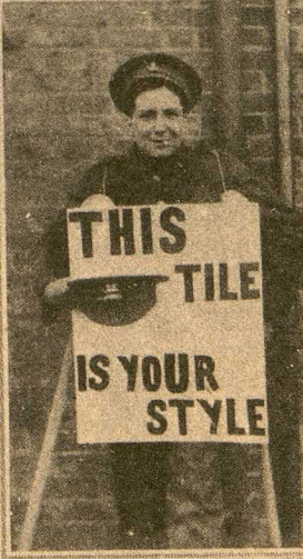
A Novel Recruiting Suggestion at Walton.—This wounded soldier has hit on a telling idea to attract recruits.