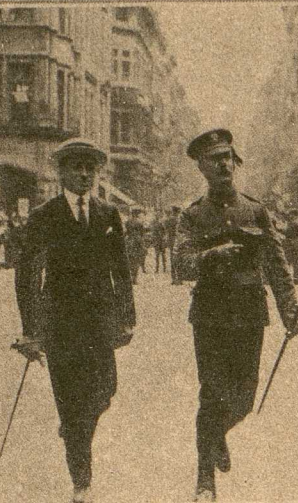
A Recruiter and his Capture in the City.—A well-dressed young man willingly assents to the recruiting sergeant's arguments.