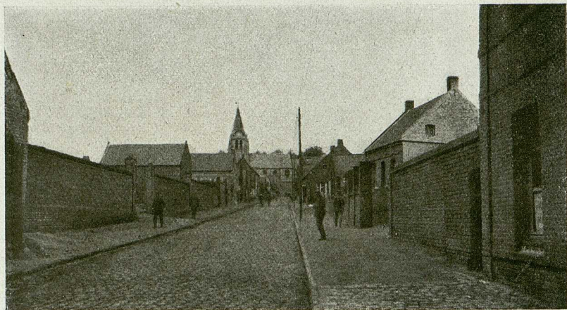
Bugnicourt (Juni 1917)