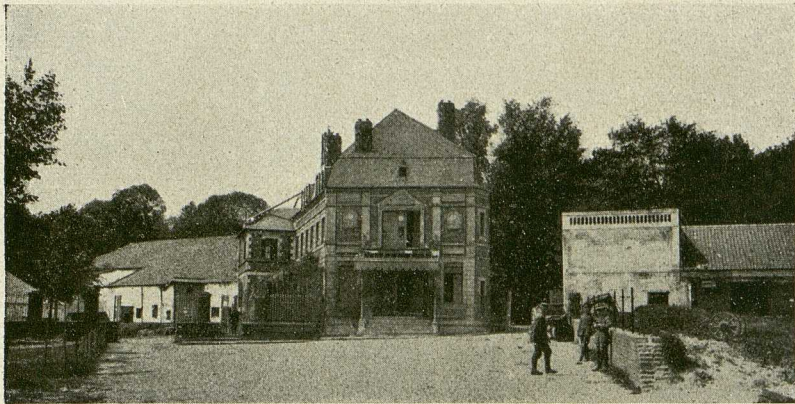
Baralle. Schloß (Juni 1917)