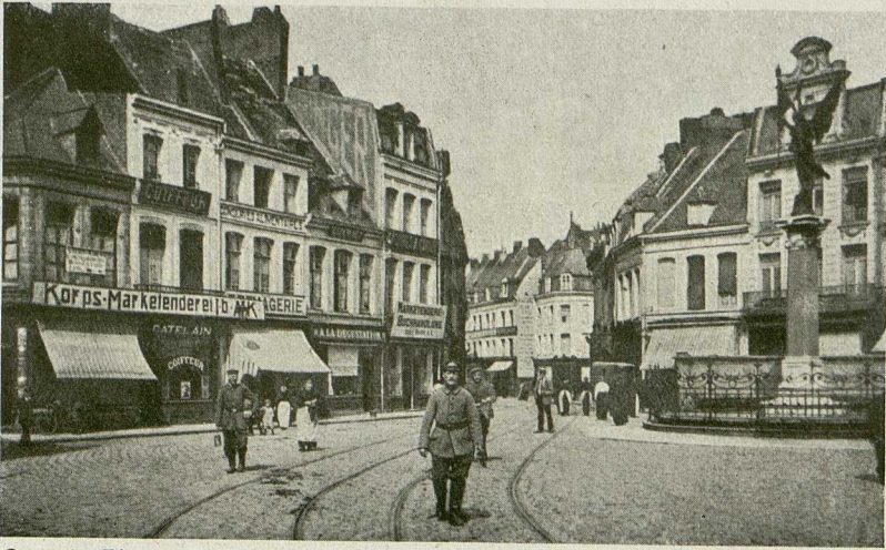
Douai. Thiers-Platz mit Friedenssäule