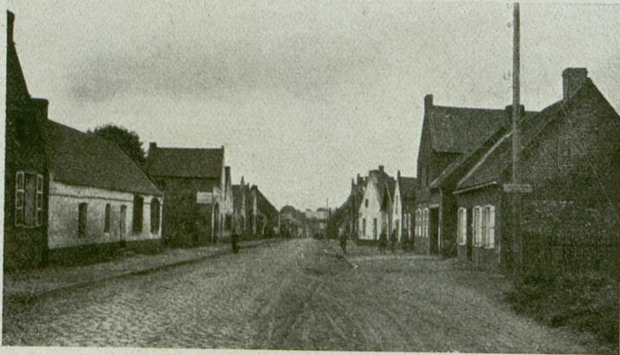
Cantin. Dorfstraße (Juni 1917)