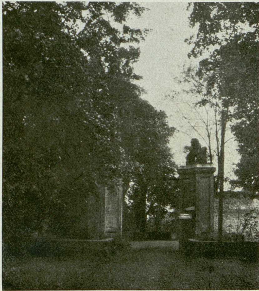
Quincy. Schloßeingang (Juni 1917)