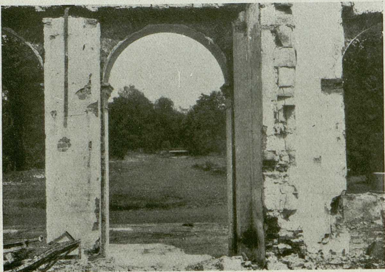
Esquerchin. Schloßruine mit Ausblick auf Park (Juni 1917) Gefr. Lorenz