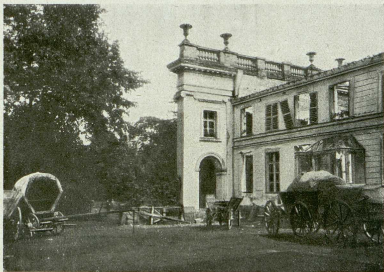
Esquerchin. Schloßruine (Mai 1917)