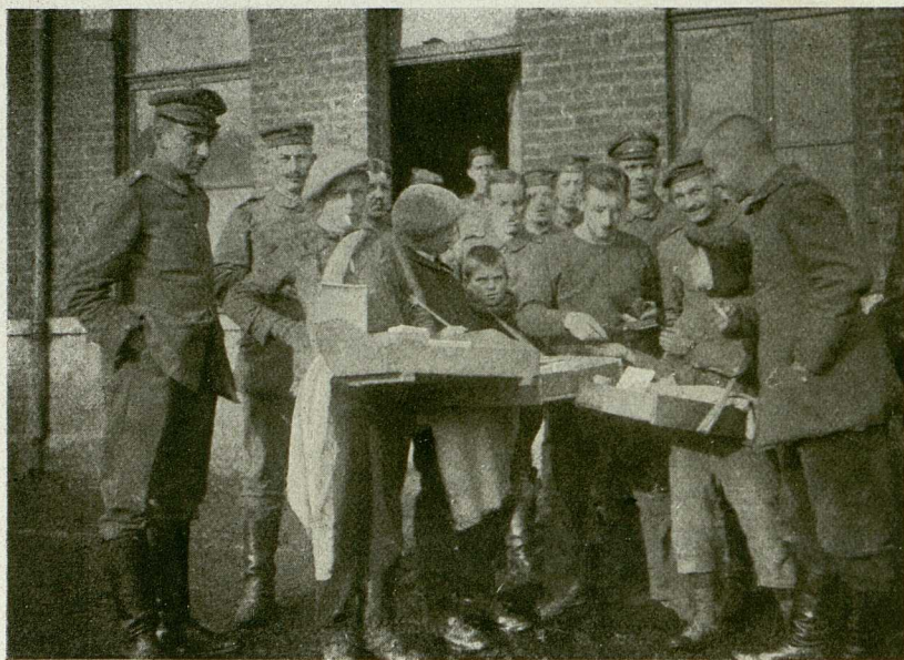
Sallaumines. Straßenhändler (November 1915)