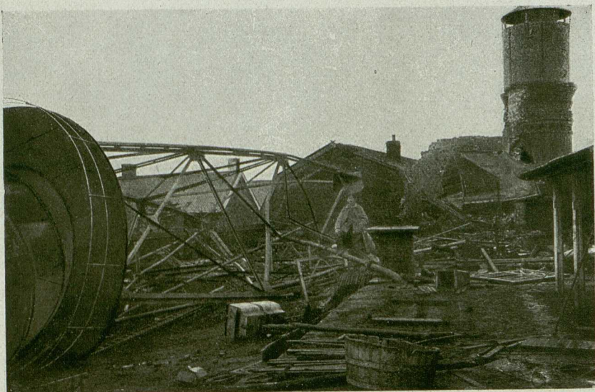
Liévin. Gesprengter Wasserturm (Juni 1916)