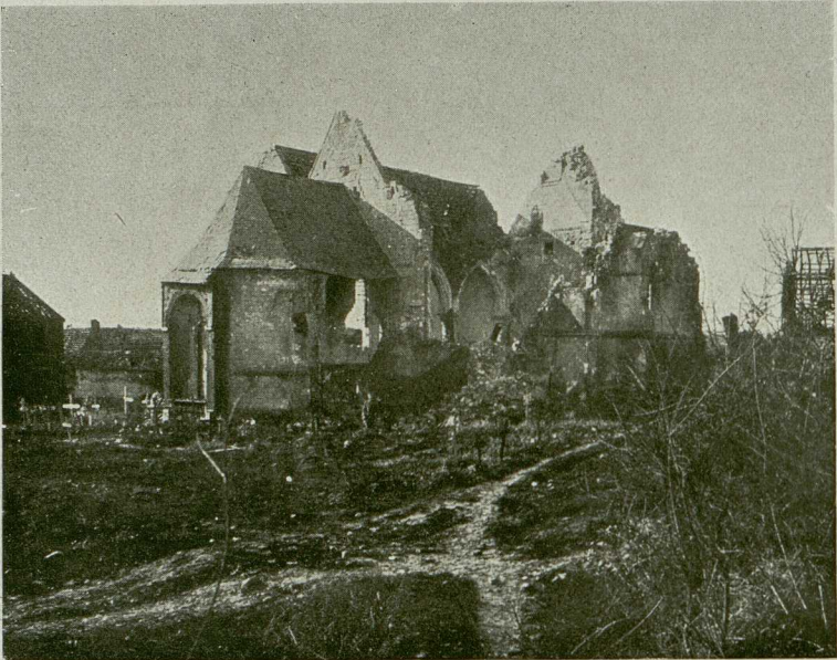
Angres. Kirchtürmchen (Juni 1916)