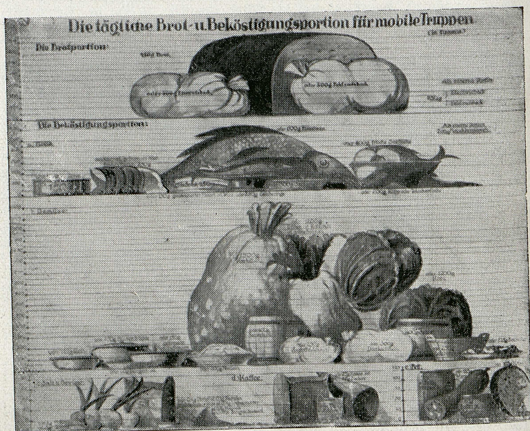
Bild Nr. 15. Portionsmaß: Die tägliche Brot- und Beköstigungsration für mobile Truppen. Brotportion: 750 g Brot oder 500 g Feldzwieback oder 400 g Gierzwieback. Beköstigungsportion vgl. auf Seite 22 bis 25 die dort angegebenen zugeteilten Mengen.