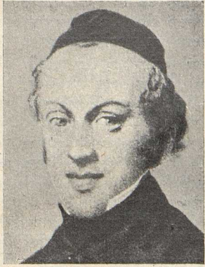
Rb. Dr. Zacharias Frankel