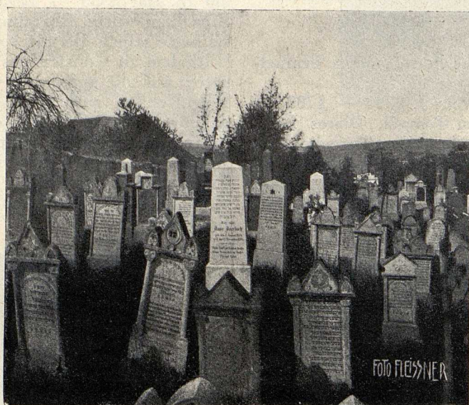
Friedhof (Neuer Teil)