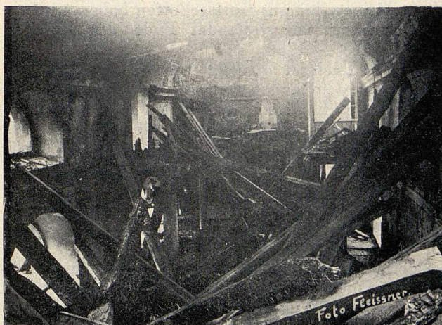
Brand 1911: Tempelinneres