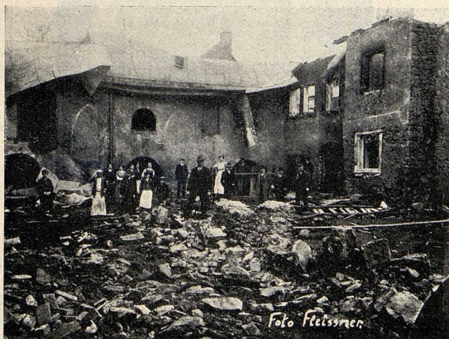
Brand 1911: Tempelhof