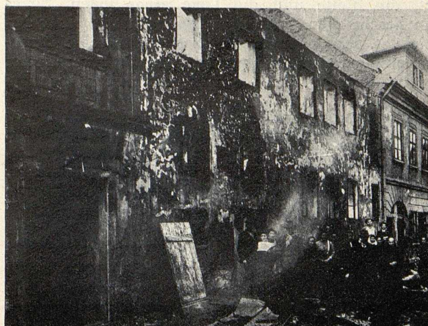
Brand 1911: Tempelgang und Haus Nr. 518 und 125