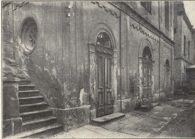
Aufgang zum alten Tempel