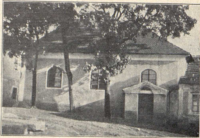
Synagoga v Kosové Hoře