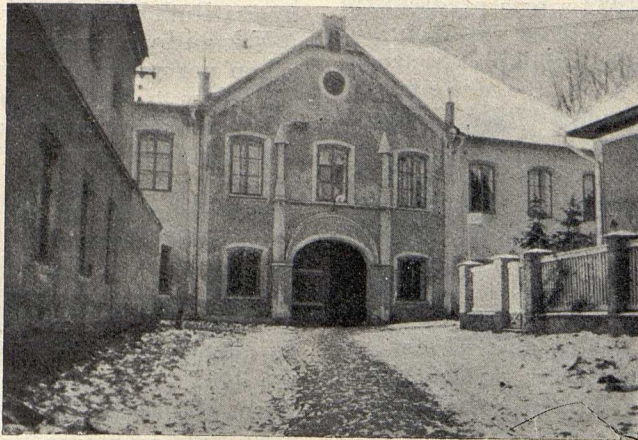
Synagoga v Sedlčanech