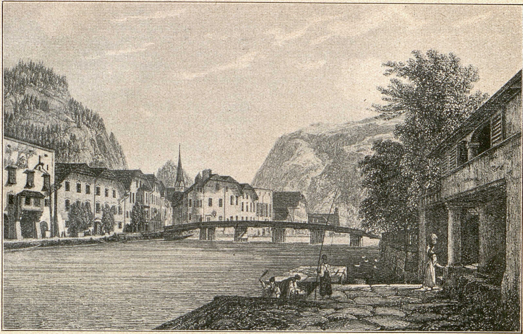
Bad Ischl: Das alte Rathaus. Stich von Thomas Ender, 1828.