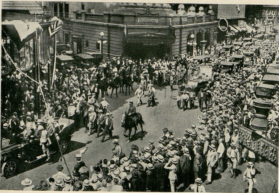
Die Bevölkerung von St. Paul bereitet dem republikanischen Präsidentschaftskandidaten einen warmen Empfang