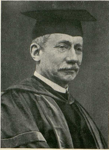
Elihu Root Amerikanischer Präsidentschaftskandidat