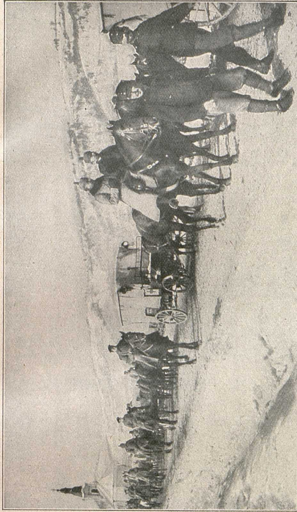
Deutsche Sanitätskolonnen kommen durch ein Karpatendorf.