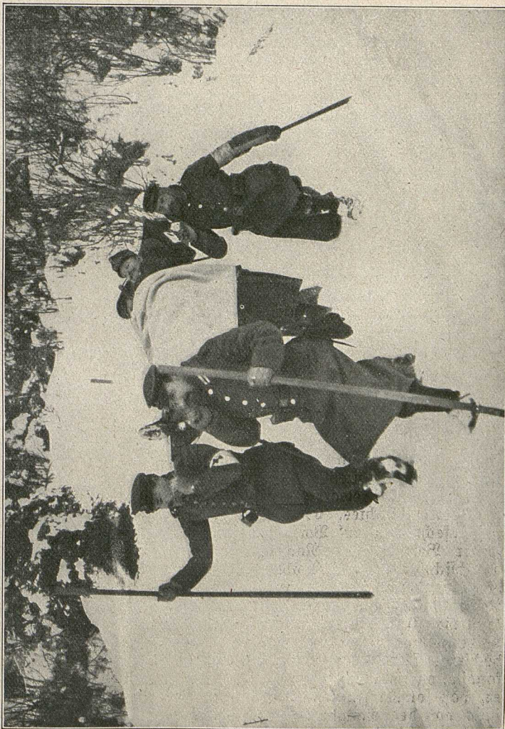
Deutsche Sanitätsoldaten bringen einen verbundenen Österreicher zur Sanitätskolonne. Zu den Kämpfen in den Karpaten.