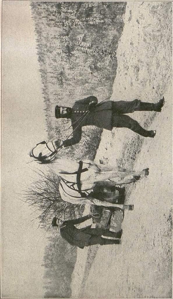
Die deutsche Feldpost wird auf Schlitten nach dem Dufkapaß befördert.