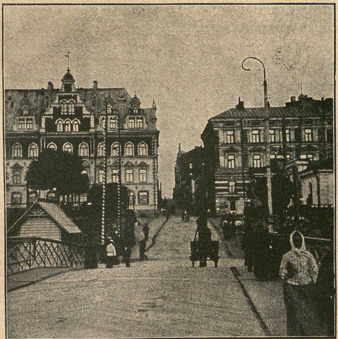
Obofskische Brücke in Wyborg.