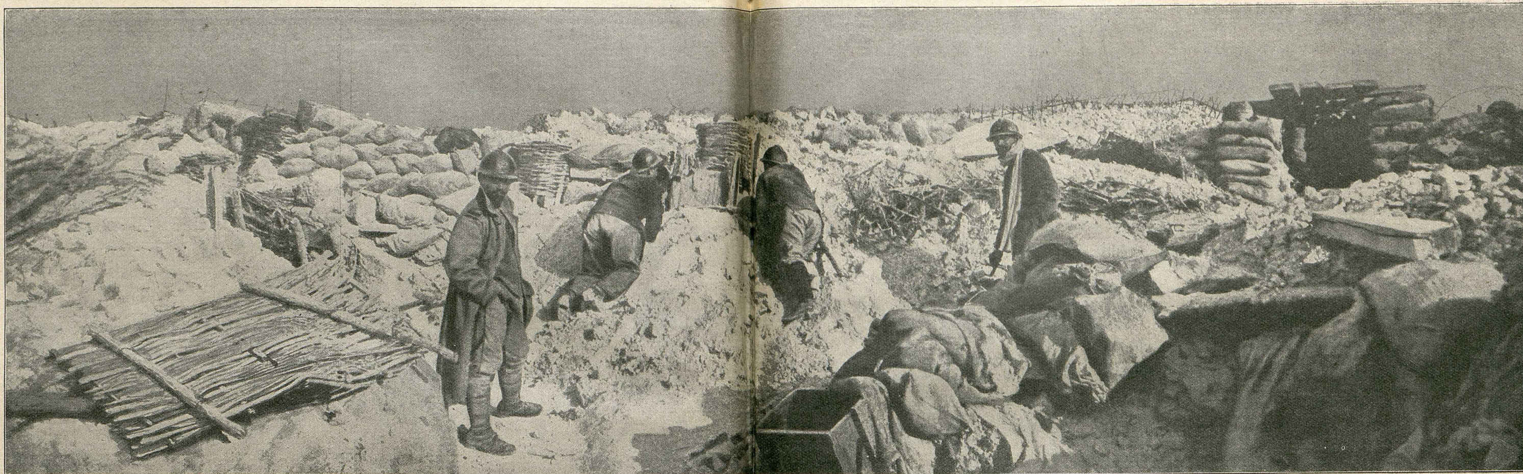
Bau eines Trichters im Angesicht der ersten feindlichen Linie, in dem sich eine ganze Kompanie zum Sturm versammeln kann.