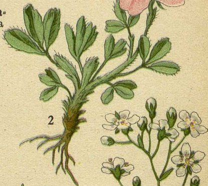
2. Dolomiten-Fingerkraut ( Potentilla nitida )