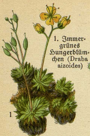
1. Immergrünes Hungerblümchen ( Draba aizoides )