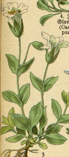
Breitblättriges Hornkraut ( Cerastium latifolium )