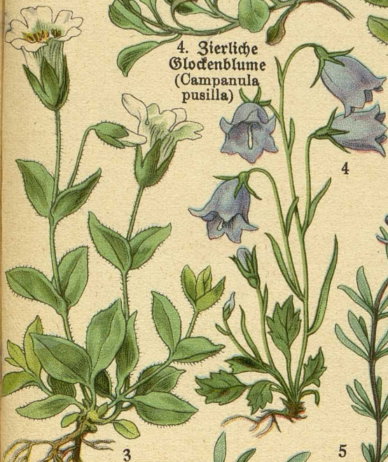
4. Zierliche Glockenblume ( Campanula pusilla )