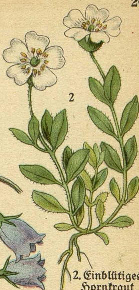
2. Einblütiges Hornkraut ( Cerastium uniflorum )