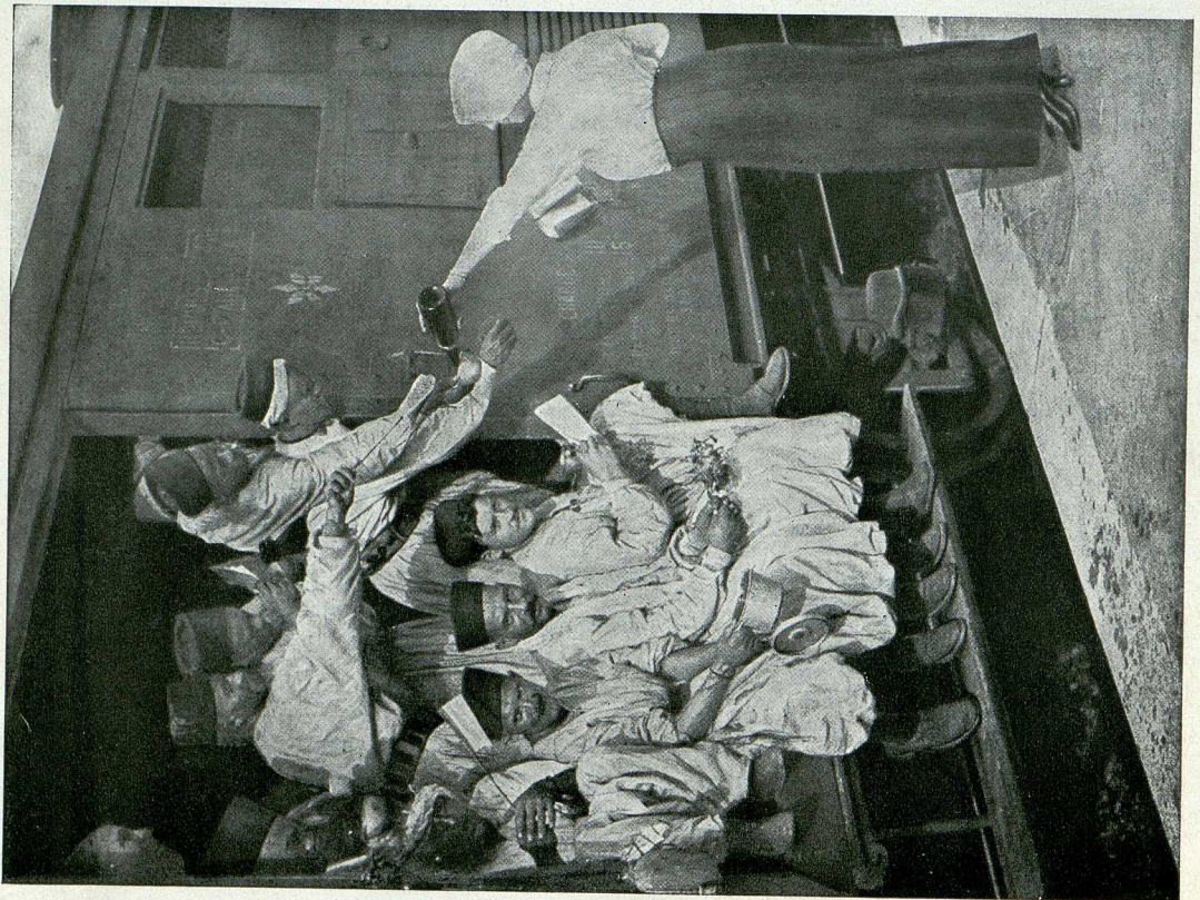
Zugaben auf der Durchfahrt durch Paris.