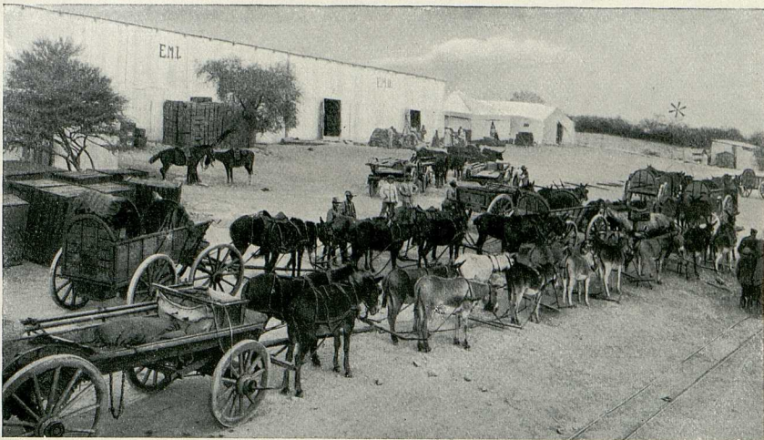
Magazine in Windhuk; Kolonnen beim Verladen