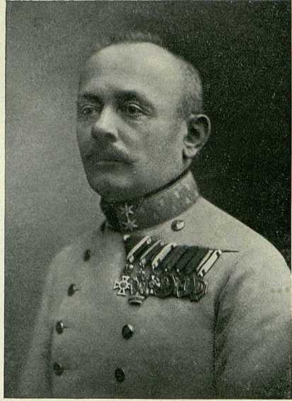
Gen. d. Inf. Svetozar v. Boroevic v. Bojna