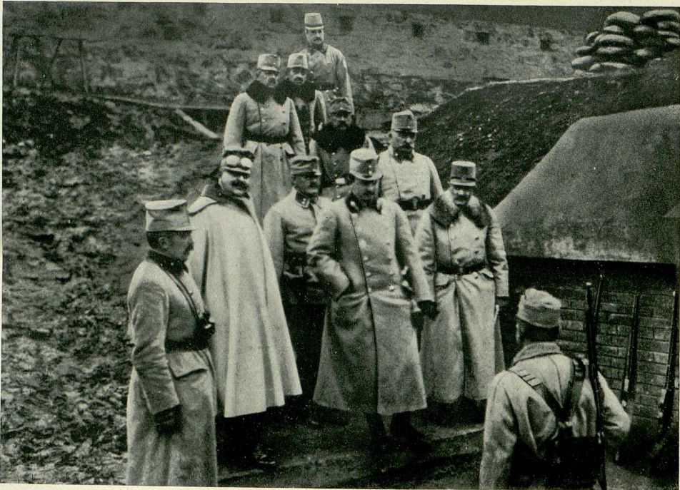
Der Erzherzog-Thronfolger Karl Franz Josef in den Befestigungswerken von Przemyśl