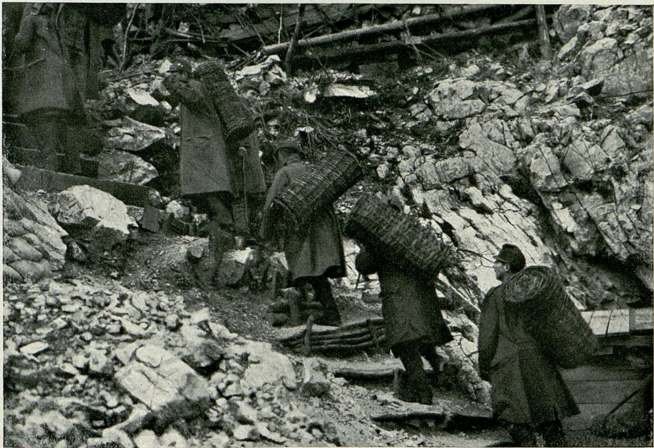
Phot. M 3 Gf, Budapest

Ein österreichisch-ungarischer 30,5 cm Mörser im Feuer an der Isonzofront