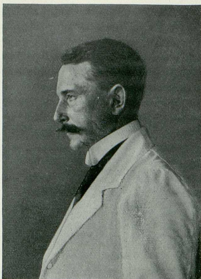
Geh. Reg.-Rat Dr. A. H. H. Schnee Der Gouverneur von Deutsch-Ostafrika