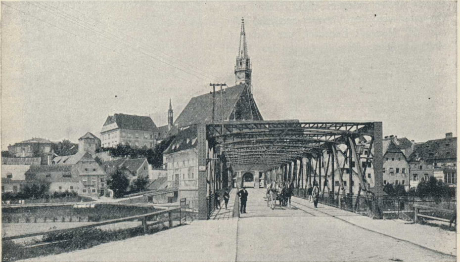
Steyr, obere Ennsbrücke mit Neutor, Stadtpfarrkirche und Pfarrhof

dieser Tour zu verbinden. Der ganze Rundgang erfordert einen Zeitaufwand von kaum zwei Stunden, und man genießt dabei einen Ueberblick über alle Stadtteile der