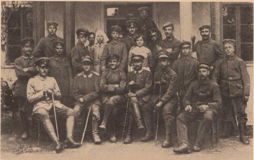
Sächsische Freiwillige in Litauen