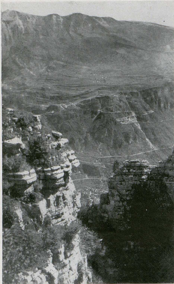
Blick von einem Standpunkt südlich der Kote 1068, am Ostrande des Tonezza-plateaus, gegen die Assaschlucht

Rechts im Bilde eine schmale, längliche, nach beiden Seiten mit steilen Wänden abfallende Felsrippe, die den westlichen Steilabfällen vorgelegt ist.