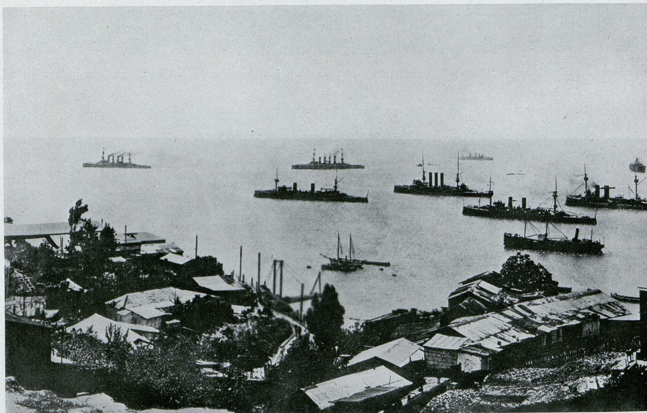
Das Kreuzergeschwader im Hafen von Valparaiso. Es bestand aus den Panzerkreuzern „Scharnhorst“ und „Gneisenau“ (2 Schornsteine) und den Kreuzern „Nürnberg“, „Leipzig“, „Dresden“. Neben den deutschen ankern chilenische Schiffe.