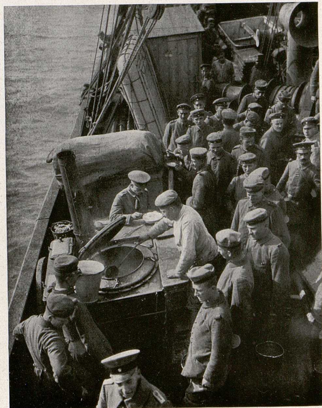
Während der Überfahrt.