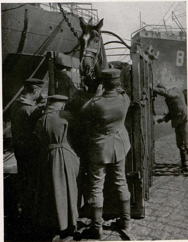
Verladen der Pferde.