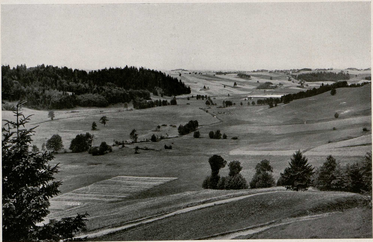
Landschaft aus dem nördlichen Ostpreußen, Gegend Gumbinnen, dem Schauplatz der ersten Kämpfe an der Ostfront.