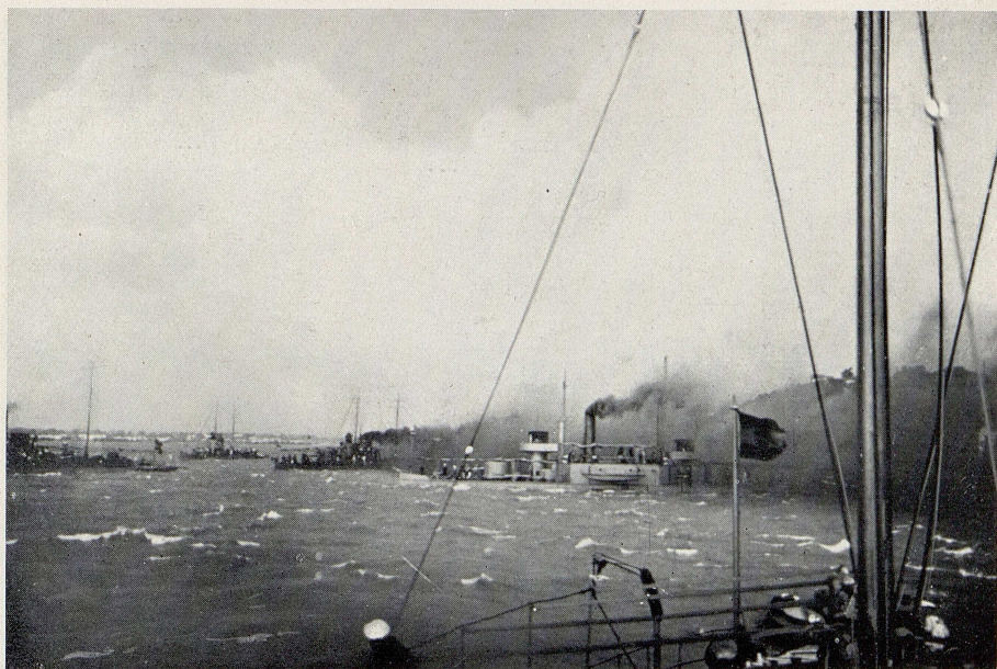
Sturm in Rustschuk.