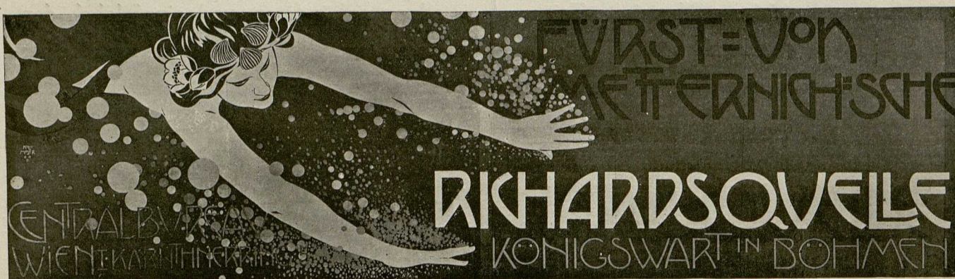
Abb. 50. Koloman Moser. Richardsquelle. 39:173.

kung. Im Bildfelde sitzt eine dralle Schützenliesl und weist auf das weit entfernte Herz, das die Zielscheibe bildet. An der