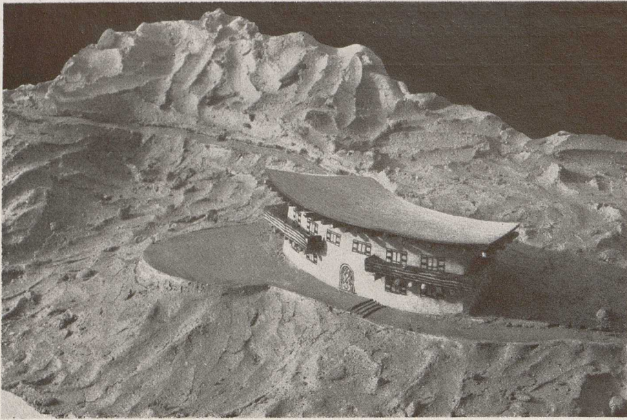
Hans Arndt: Modell für ein Schutzhaus am Sonnblick. 1932