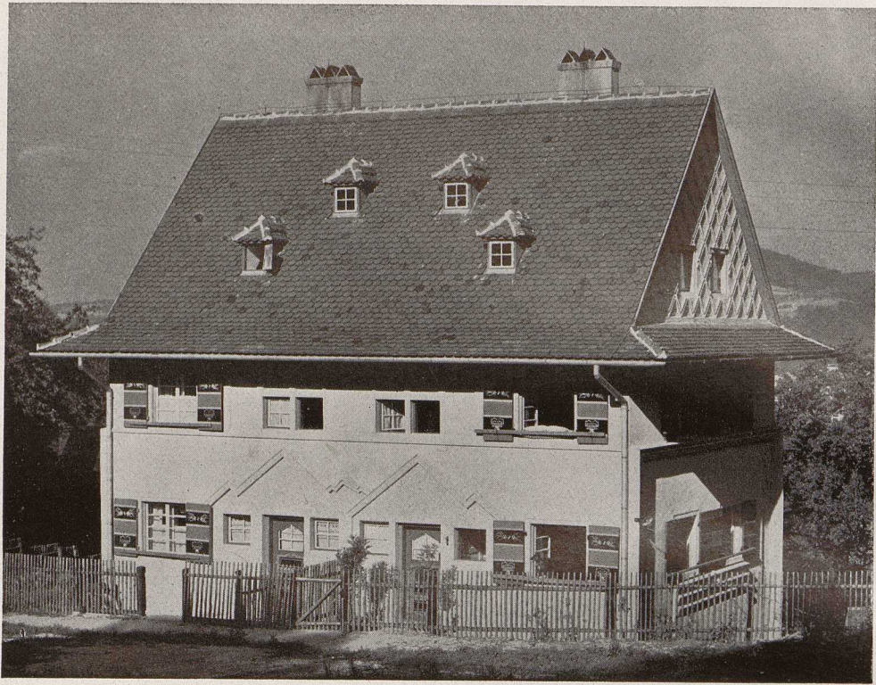
Siedlungsdoppelhaus der Baugenossenschaft „Familie“, Linz, Römerbergsiedlung. 1925