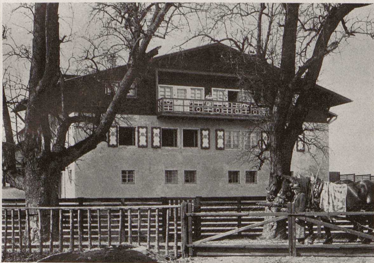
Beamtenwohnhaus der Permanganat- fabrik in Linz. 1920