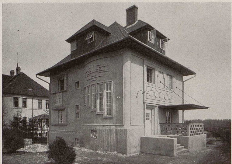
Beamtenwohnhaus der Saccharinfabrik in St. Peter bei Linz. 1923