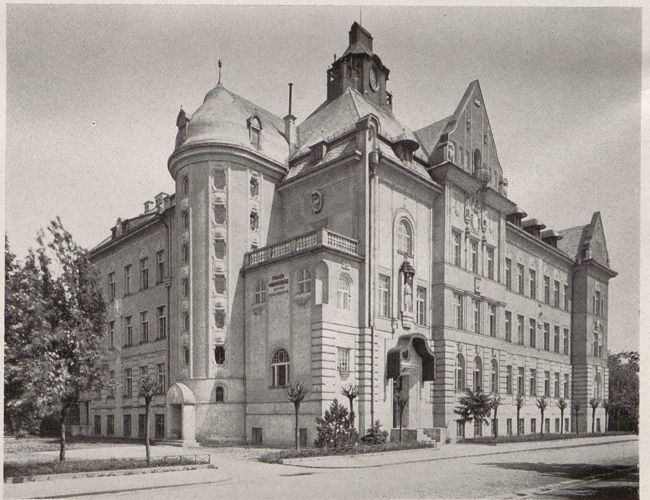
Mädchenlyzeum in Linz. 1910