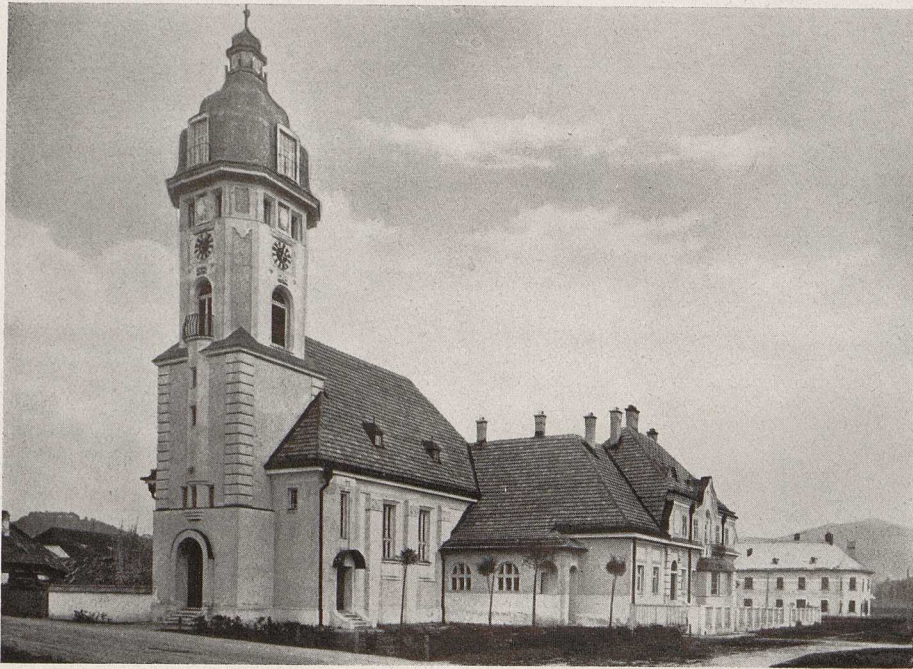
Evangelische Kirche in St. Veit a. d. Glan, Kärnten. 1909-12