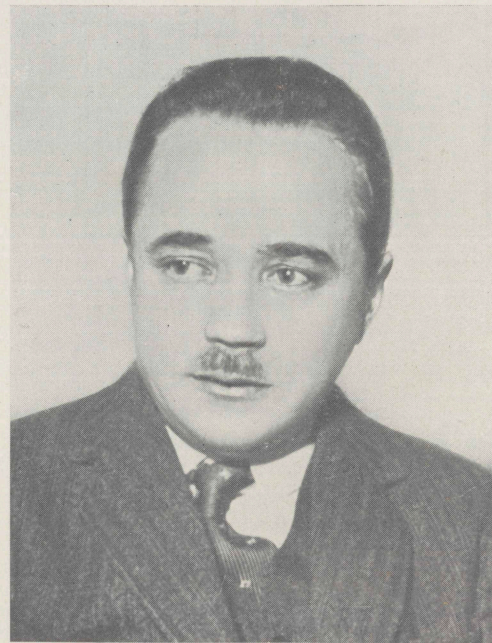
Dr. Engelbert Dollfuß †